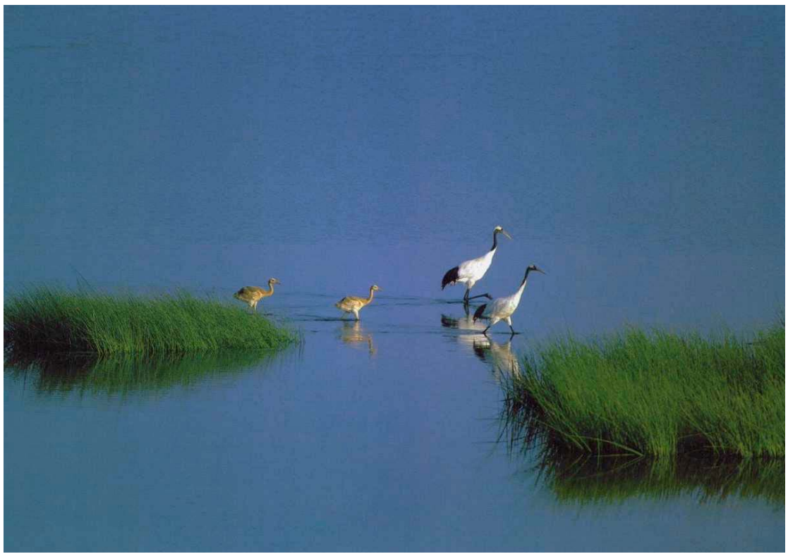
Red crowned cranes Grus japonensis with chicks, Kushiro marsh, Hokkaido

Hokkaido holds a wide variety of wetlands, including five Ramsar sites, namely the Akkeshiko Bekanbeushi Marshes, the Kiritappu Marshes, the Kushiro Marshes, Lake Utonai and Lake Kutcharo. A wide variety of high quality information on the wetlands is available in Hokkaido from municipal governments, institutional organisations and local NGOs.