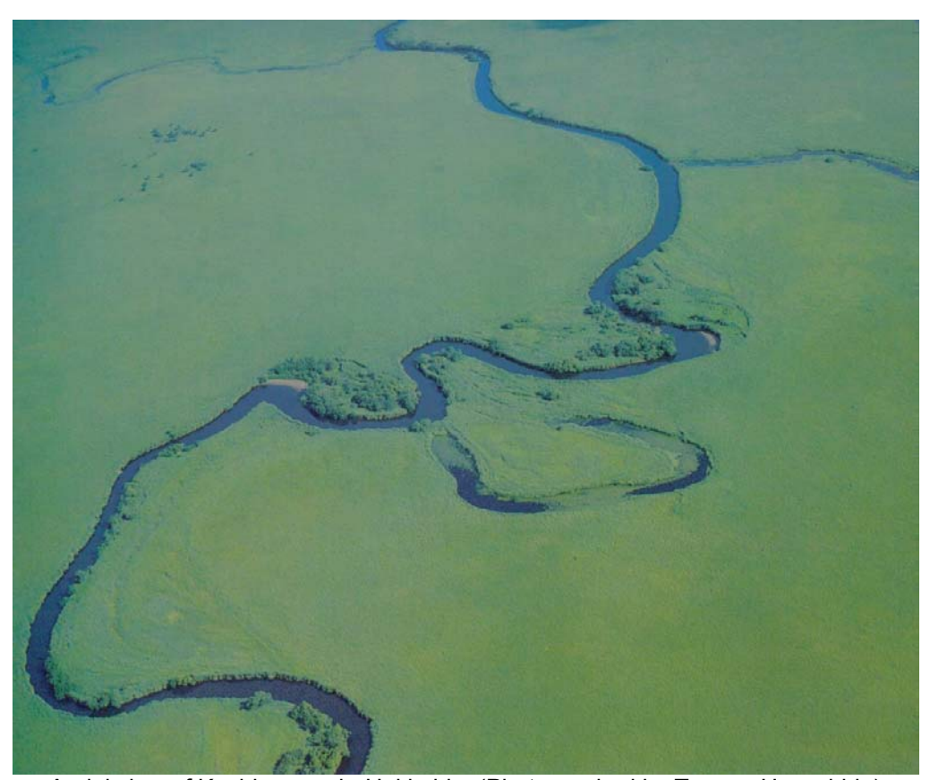
Aerial view of Kushiro marsh, Hokkaido.

Hokkaido is located between longitudes139°20' East and 148°53' East; and between latitudes 41°21' North and 45°33' North. Hokkaido covers an area of approximately 83,000 km². This represents 22% of the land area of Japan and it is the second largest island in Japan. The island is surrounded by the Pacific Ocean to the south and east, the Sea of Japan to the south-west and the Sea of Okhotsk to the north. In the center of the island, there are volcanic mountain chains. Hokkaido has remained comparatively undeveloped.