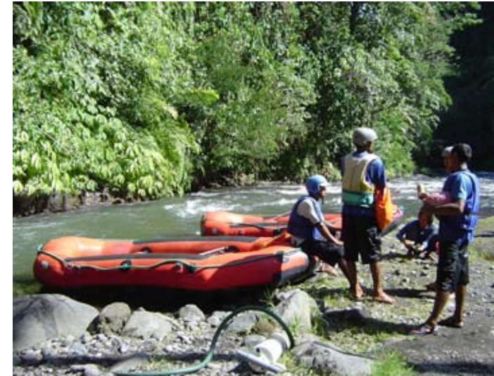
Rafting through rice fields Bali

area of their own free will and without payment (except, in some cases, to cover their basic living expenses); donations are gifts or money, or in some cases goods and services, that are donated to support the conservation of wetland areas.