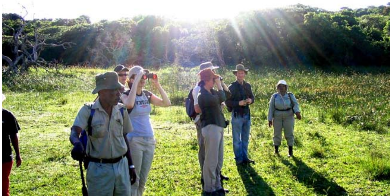
Safari on foot in St Lucia Wetland Park