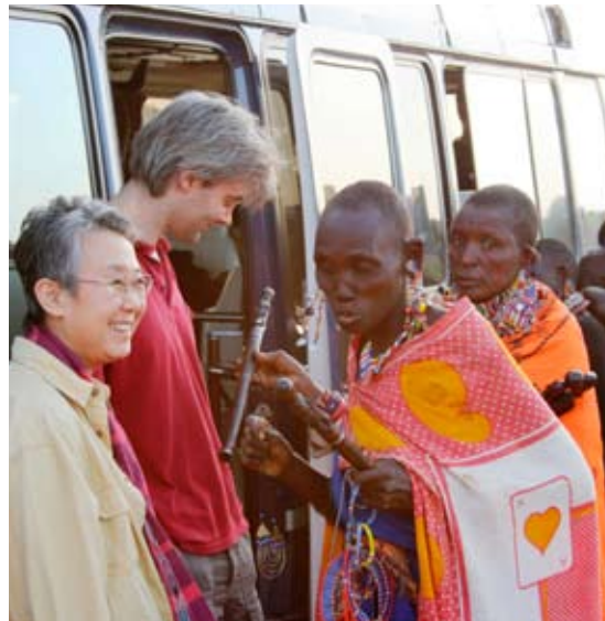
Masai selling handicrafts to tourists