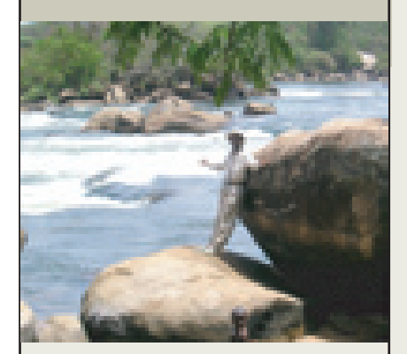
Kalagala Falls Site, the proposed Off-set for loss of Bujagali Falls