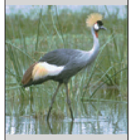
Crowned Crane (Uganda Crane), which nests in wetlands and is endangered