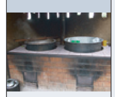
Improved Energy Efficient firewood stove