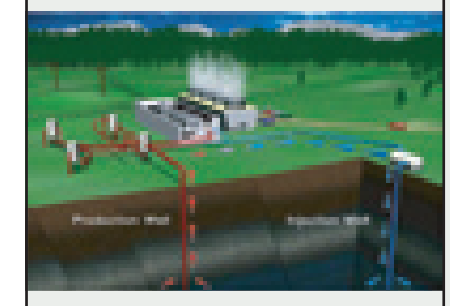
Geothermal installation design

has been limited, but could prove more relevant to national energy development and energy security needs. Therefore, the NELSAP report has limited national interests and is not an adequate basis for decision-making regarding power development options for Uganda.