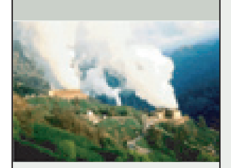
A Geothermal Plant in Operation