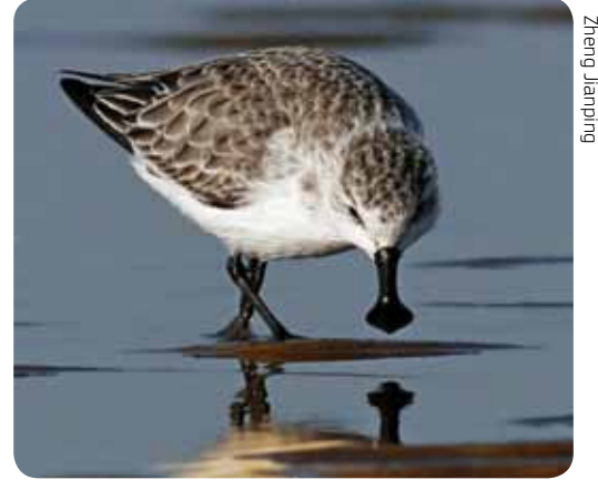
Spoon-billed Sandpiper wintering at the Min Jiang Estuary, Fujian Province, China.

Many more waterbirds are threatened with extinction in East Asia-Australasia than in other flyways. (Numbers on map include both threatened and near-threatened waterbird species.)