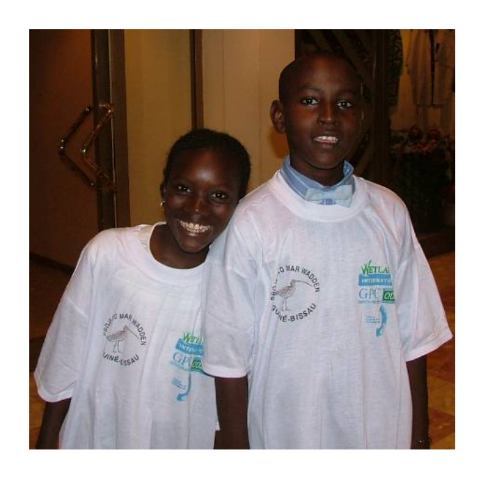
Children from Guinea-Bissau in west Africa wearing t-shirts from a twinning arrangement with the Wadden Sea in Europe