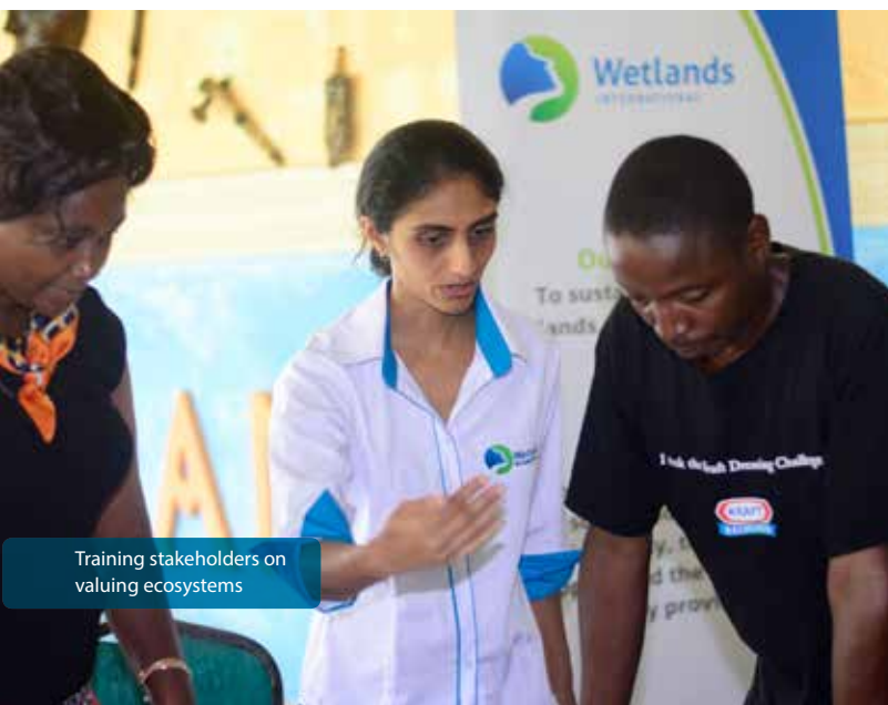
Training stakeholders on valuing ecosystems