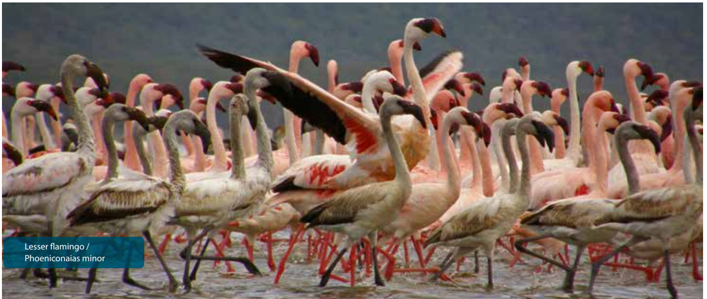
Lesser flamingo / Phoeniconaias minor

To sustain and restore wetlands, their resources and biodiversity.