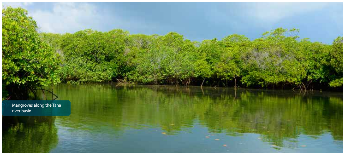
Mangroves along the Tana river basin