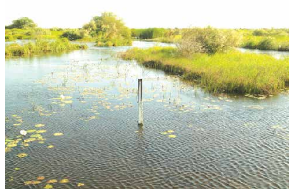
Simina's hill in the north-central of Mali