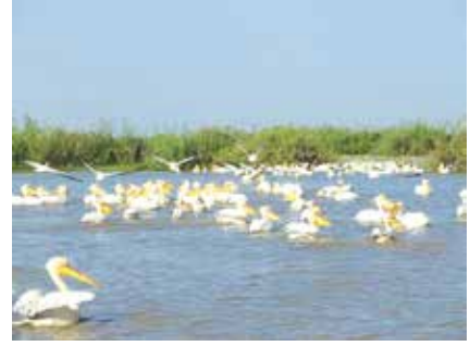
Migratory Birds. Wetlands international remains convinced that it is through a joint Co-operation with their partners and the people living within the threatened wetland areas that will lead to the awareness of the conservation measures of the migratory birds. In the transition to use more environmentally friendly methods to protect life on earth, the best audience would be the children, who in a few years will lead to the development of their countries.