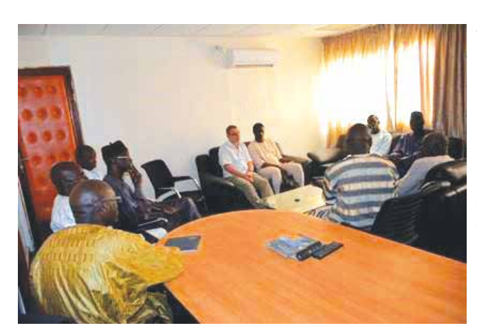
Signing convention ceremony at the Foundiougne District Council, Sénégal

As part of the Mangrove Platform introduced in March by the District Council of this area with the technical and financial support of Wetlands International, the two institutions have signed on, December 4, 2015 a Partnership Agreement for a better management of the Biosphere Reserve of the Saloum Delta (RBDS).