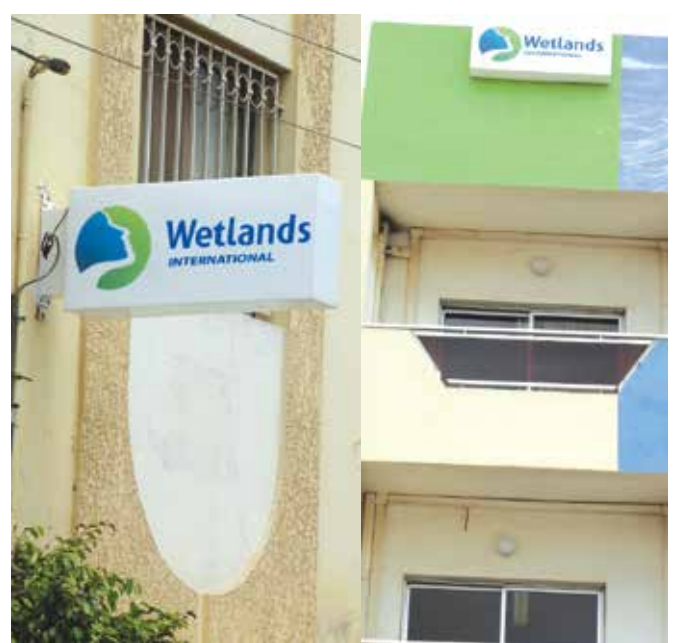
Wetlands international Africa Regional Office, Zone B, Dakar, Senegal

Wetlands International is the only global not-for-profit organization dedicated to the conservation and restoration of wetlands. The organization is headquartered in the Netherlands and has been working to protect wetlands with 60 years of experience serving the people.