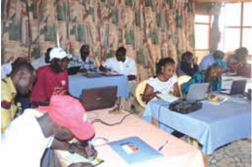
Northern Journalists and Central Sénégal in a training on Climate change in April 2015 at Saint-Louis and Foundiougne.