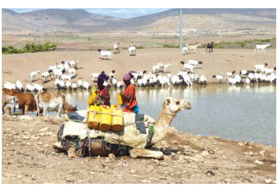
Women and livestock in a trough in Ethiopia