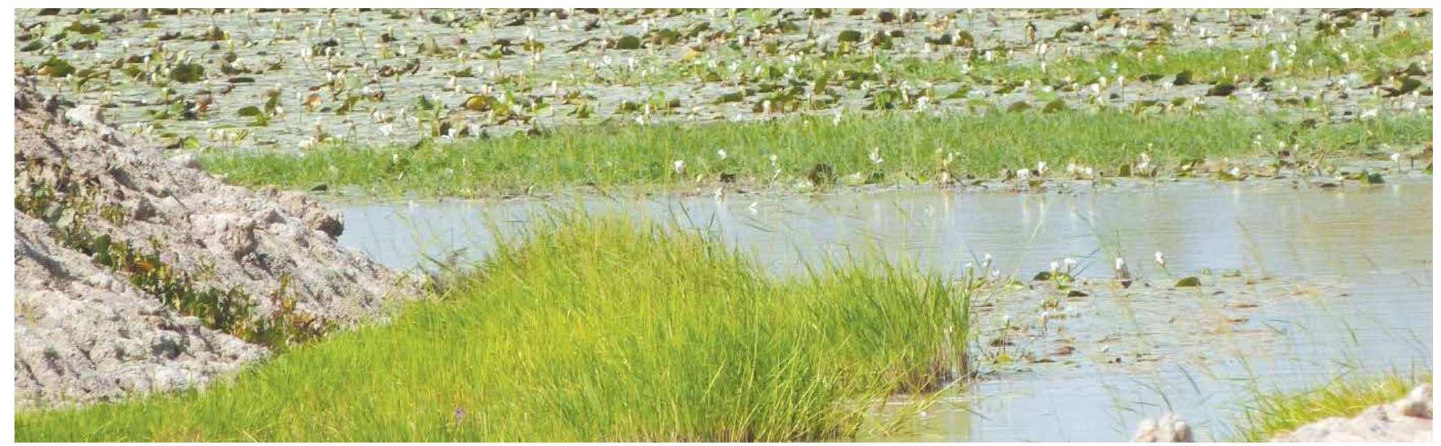
Ecosystems restored after the dredging of Noga channel, central north of Mali

With a length of 2km 104 m, work on the Noga channel which began will allow flooding and restoration of ecosystem services in 5 ponds and plains by flushing their main supply channel. The plains in question have an area of about 5,000 ha which benefits more Noga villages, where the PfR operates in five (5) other villages that will benefit from this site. The channel will contribute to local development of 5 villages through the promotion of agricultural and forestry-pastoral activities.