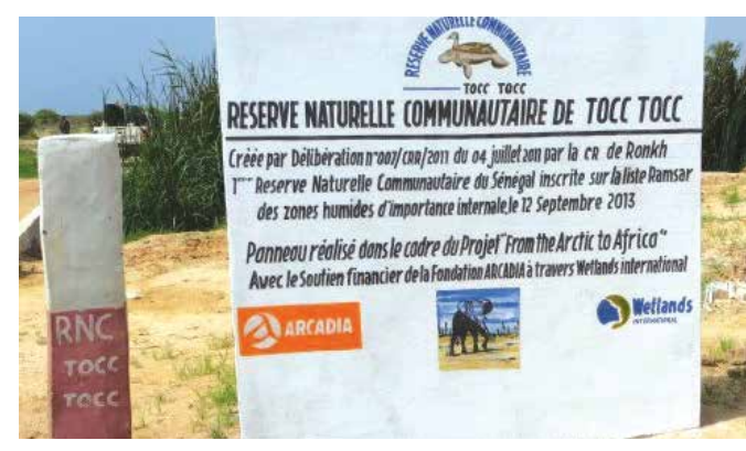
Sign boards installed in the Tocc Tocc Reserve in Sénégal

In 2013 a Communication Plan was developed as part of the Ecosystem Alliance and has been pursued until the end of the program at the end of the year.