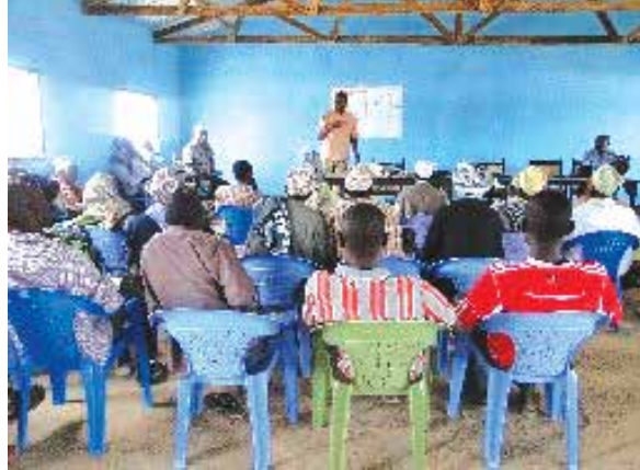
Caravan of camels for the preservation of Ewaso Nyiro ecosystems and community meetings in Sericho on the big dam of Isiolo in Kenya

Initiated by the Partners for Resilience (PfR) programme in Kenya, pastoral communities from Isiolo, Laikipia and Samburu Counties participated in a 5-day,