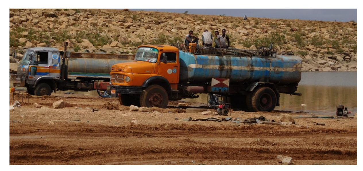
Water trucking in Elbahay dam

Elbahay earthen dam is overburdened by free users and lacks an appropriate owner who cares about its maintenance and long-term sustainability. Even worse, these free users are jeopardising the future of the dam by using it for purposes that can harm the water quality and its life span.