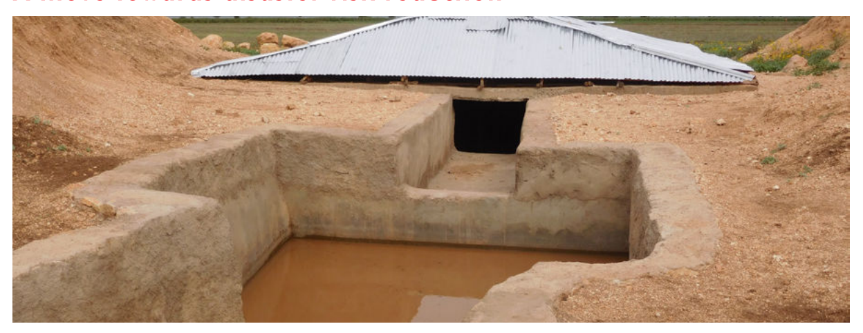
One of the birkads in Laftagalol Kebele

Somali Region of Ethiopia experiences severe and chronic food and water insecurities. The frequency of droughts has increased from once in every 10 years in the 1970-80s to twice per decade in the 1990s, and in the recent years to once every 2–3 years. Flooding, which is becoming perennial, is the consequence of high rainfall in the upstream highlands combined with severely degraded vegetation and soil cover that has left the ground barren and unable to absorb water, leading to high runoff and fatal flash floods when it rains.