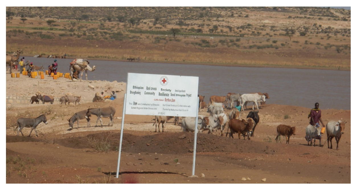
Laftagalol earthen dam

Water shortage is a critical challenge for Somali Region pastoral communities. The problem worsens in prolonged and cyclic drought situations. Reliable and perennial water sources are not available in most areas in the region. Sufficient water is only available during the erratic short rainy seasons. The high permeability of sandy soil exacerbates the limitation of surface water availability after rainfall.