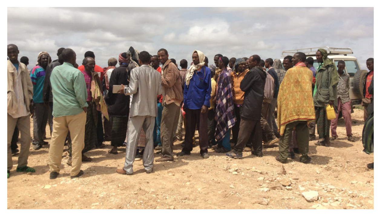
Community members of Kebreahmed Kebele in a meeting

Somali people are the most drought-affected and vulnerable community in Ethiopia. In addition, they have suffered from a lack of inclusive development for a long time and the region has remained one of the least developed in the country, named the 'emerging region.' The main economic activity of the Somali community is animal production with minimal support from crop production. It is often not enough and due to