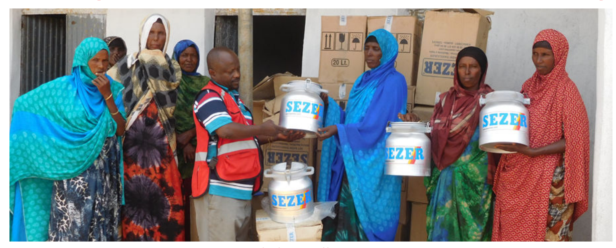
Tikidem milk group

In Gursum woreda women bear the heaviest burden in family management, and often, they are excluded from participating in development. One opportunity for them under the Protracted Crisis Programme was the formation of income generating activities (IGAs) to help them improve their livelihoods. Through the IGAs, women with common problems came together with the purpose of pooling resources, gathering information and offering mutual support to one another. Among the IGAs that the Protracted Crisis Programme helped to start were milk groups that women could use to buy and sell milk.