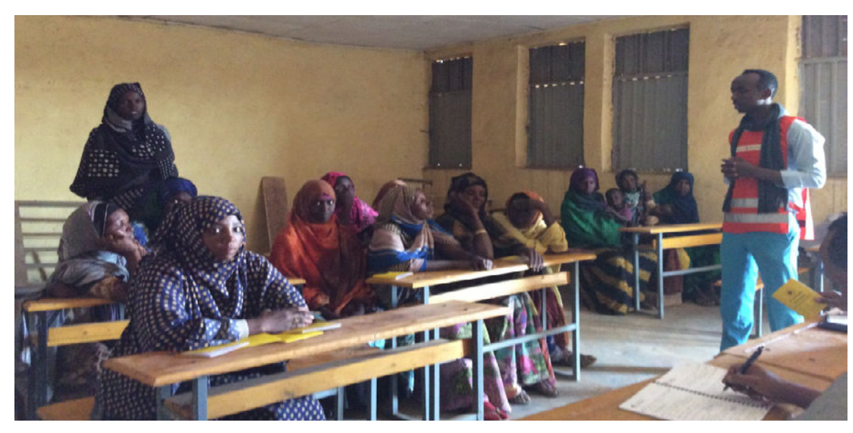
Self Help Group in a business training session

The Protracted Crisis Programme showed practical changes in the lives of the target communities in many ways. For example, the programme managed to change the attitude of the self-help groups (SHGs) and income generating activity (IGA) groups, especially in terms of looking for livelihood diversification options. Through the programme, group members received business management trainings and subsidies to help them link all possible businesses in their area to diversify their livelihood bases. The economic empowerment through livestock fattening