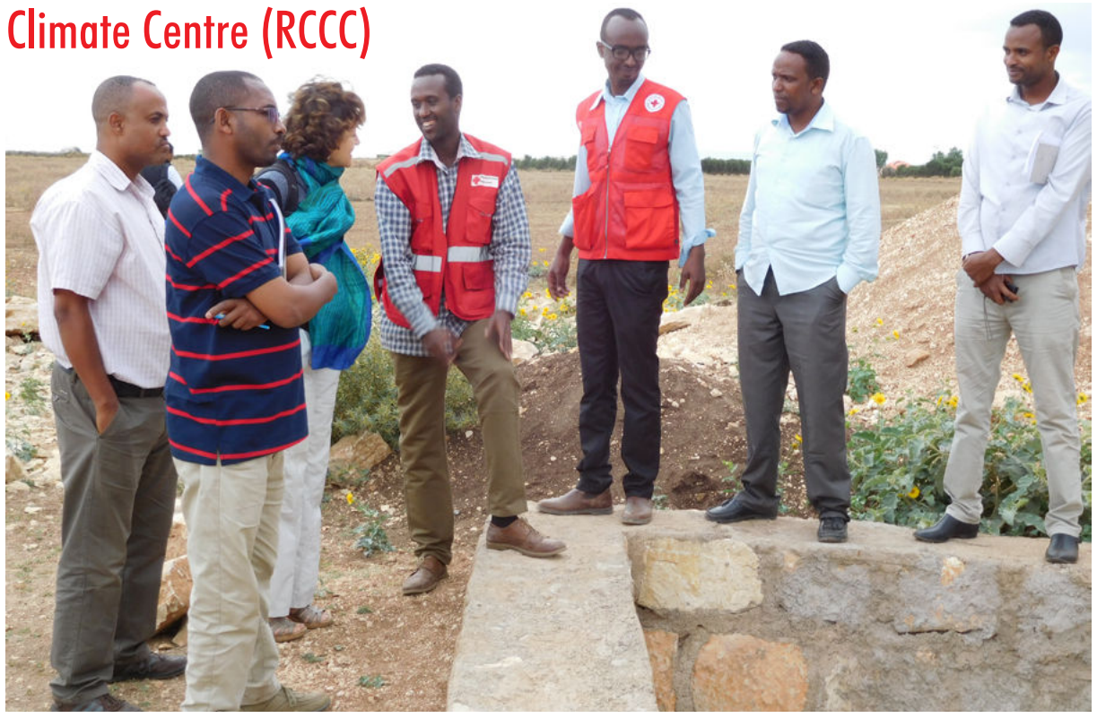
Staff of NLRC, ERCS and Wetlands International inspecting one of the birkads under construction

Early warning can save lives: A case of Red Cross/Red Crescent