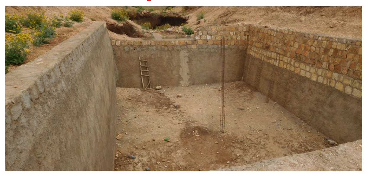
A birkad under construction

Lack of water and proper storage capacity during the dry season is one of the biggest challenges in Laftagalol Kebele. The local community is sometimes forced to travel long distances in search of water for their households and livestock. Due to the stress of the journey for animals, milk production is reduced thus affecting food security among households. When the water problem worsens, people are forced to shift their homes temporarily to live closer to the water points until the rains come. This, affects education in the Kebele for school going children and the elderly who are usually left behind without proper care and nutrition.