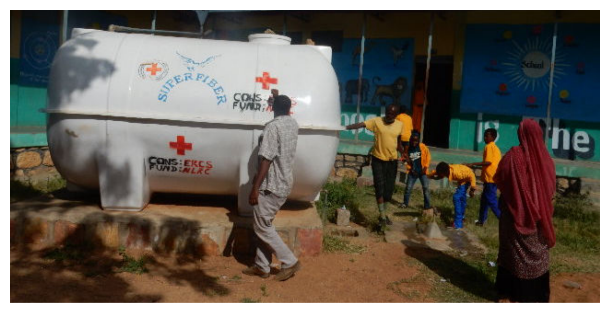
Roof catchment activity for Bombas school environmental club

Deforestation and land degradation are quite prevalent in the Fafan zone. There is very low awareness of environmental issues among the pastoralists and agropastoralists who live there. This lack of knowledge compounds the destruction of the environmental resources of Bombas town and its surrounding villages, and undermines the resilience of the communities to cope with stresses like droughts.