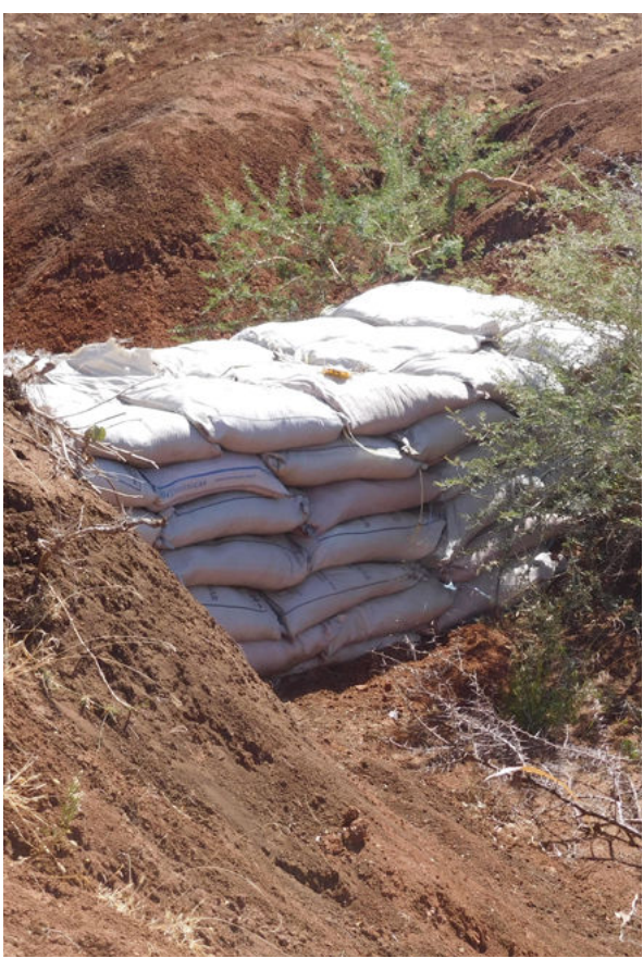
A completed soil bund

After assessing the situation, the Somali Region Agricultural and Natural Resources Development Bureau in collaboration with Wetlands International and ERCS, provided materials and technical support for free. When the time came, 150 community members came together to conserve the dam by building a fence that has greatly helped