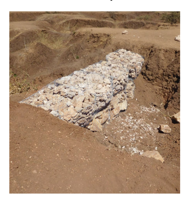
A completed gabion

Before the actual work could start, it was important to select the right time to mobilise the community. Notheless the work had to be delayed until after the busy harvest season when the community could find some time. Also, the community had to be mobilised in the right way because it mattered who was asking members to donate their labour. In this case, it was therefore decided that a request from the Somali Region Agricultural and Natural Resources Development Bureau would receive the best response.