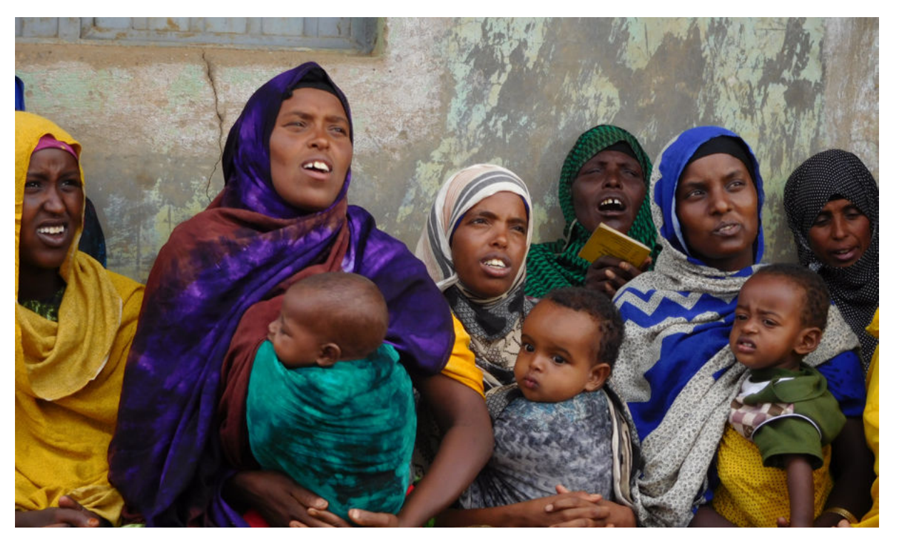
Kamburwaku women group in a meeting

The Netherlands Red Cross supports the Ethiopian Red Cross in Somali Region of Ethiopia with various activities. One of these activities is providing support to self-help groups (SHGs), primarily those of women. This is a conversation with one of the SHGs conducted in June 2017.