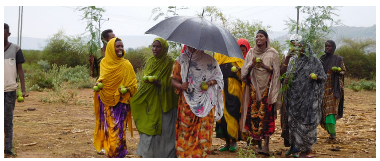
Fruit harvesting for food security in Fafan zone

Jigjiga is a drought-prone area and suffers land degradation from livestock overgrazing that leaves it bare and unproductive. Agro-forestry initiatives undertaken under the Protracted Crisis Programme sought to provide long-term solutions to the challenges of food insecurity and ecosystem degradation in the region.