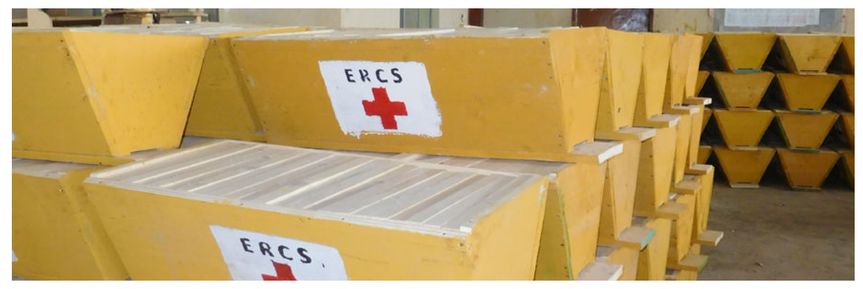
Beehives ready for distribution

Udbi Mahamud Ade, currently living with her 5 children and husband in Laftagalol Kebele, is one of the 115 beneficiaries of the Protracted Crisis Programme who received transitional beehives from ERCS, Somali branch. Overall, the programme provided 230 transitional beehives with accessories such as beeswax, queen-excluder and bee protection dress in the target areas, reaching 115 very vulnerable households that had limited access to farm land.