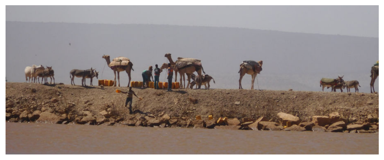
Watering of animals at Laftagalol earthen dam

Somali Region, with a population of about 5 million people depends on rain for its water supply and livestock production. Nearly 60% of the people whe reside there are pastoralists and subsist through herding of livestock. People in the region have for long suffered a series of livelihood disruptions resulting from drought. Due to erratic rainfall and lack of pasture, most of the pastoralists and their herds are forced to move long distances in search of pasture and water. Historically, traditional humanitarian and development assistance has fallen short of building sufficient capacities of communities to withstand the endemic shocks and stresses in the region.