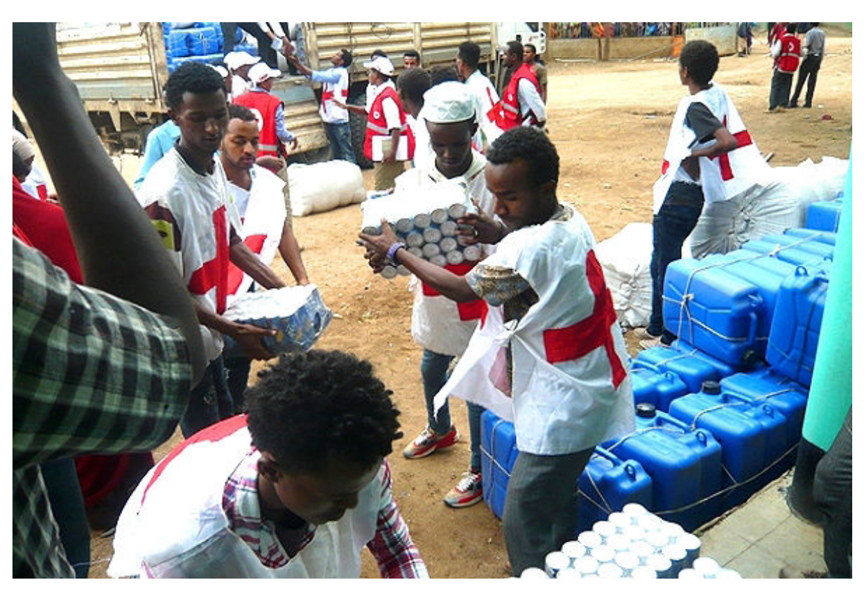
ERCS volunteers preparing to distribute humanitarian relief in Jigjiga in April 2016, where a flash flood took people by surprise

through ERCS, with support from NMA. Other implementing agencies have also shown interest in this simple yet powerful approach which enhances resilience through consistent, quality and timely early warning information and advisories for actions by different stakeholders.