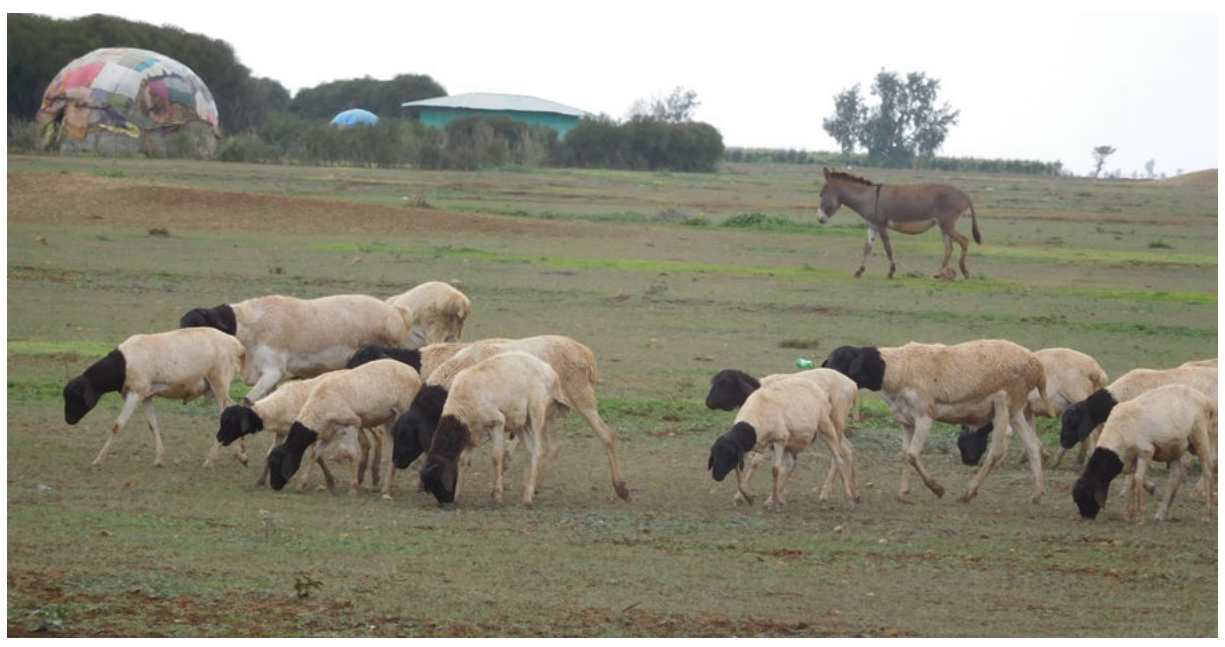
The sheep fattening project

and income generating interventions have led to reduced social marginalisation.