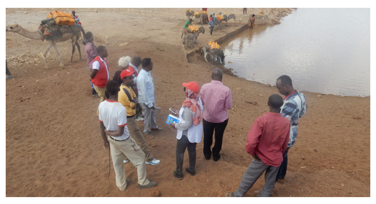
A field visit to the Laftagalol earthen dam

These lessons have been taken up by ERCS and its partners and will be reflected in the second phase of the programme.