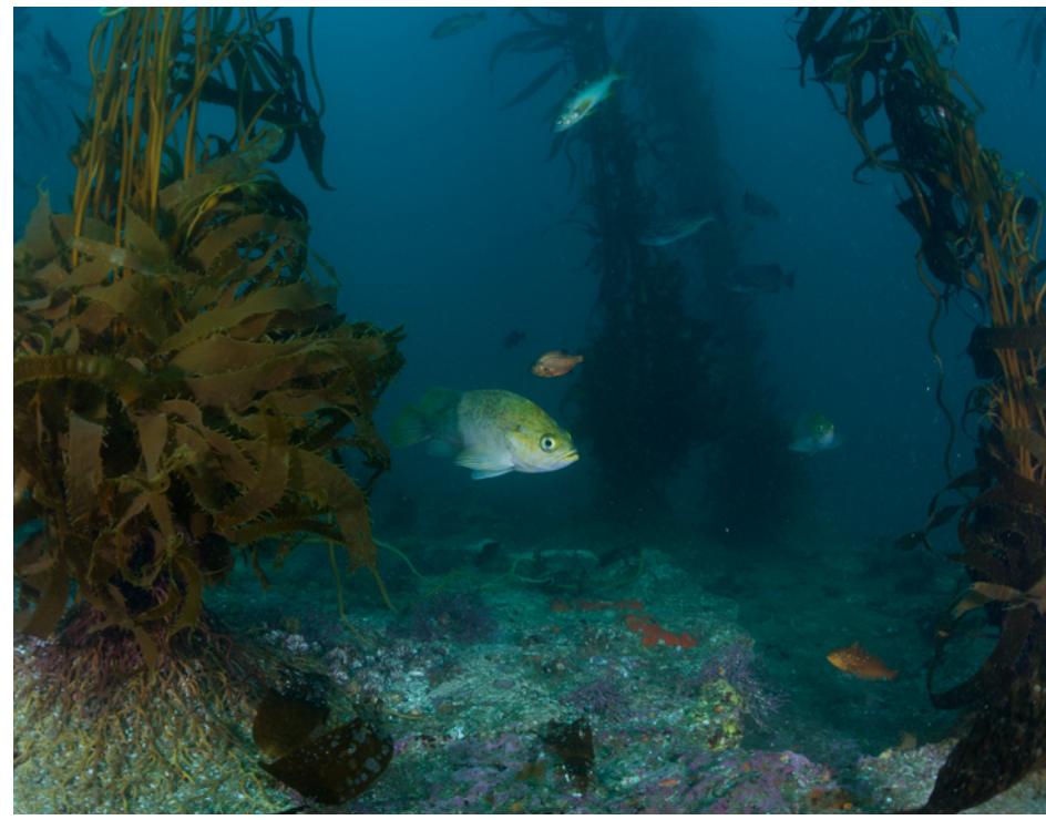
Monterey Bay, California, United States.

the ocean or atmosphere and hence cannot be considered to contribute to climate mitigation. These ecosystems are important for adaptation and resilience for coastal communities and biodiversity in many geographies and so can be included in adaptation policy mechanisms. The climate mitigation value of pelagic ecosystems, including those with mobile marine fauna and phytoplankton, is currently being investigated, but is not yet established scientifically and is unlikely to be actionable.